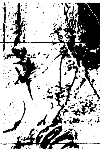
A lone rone was left Saturday at the site of a tragic accident along Napier Road.

Haensler said "basic speed" meant the car was not traveling faster than the