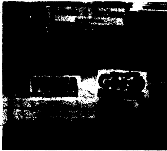
Divided loyalties abounded in yesterday's special election for the 36th District State Representative seat. The partners of this accounting firm backed opposing candidates.