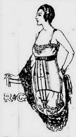
For Style and Comfort Wear the R. & G.