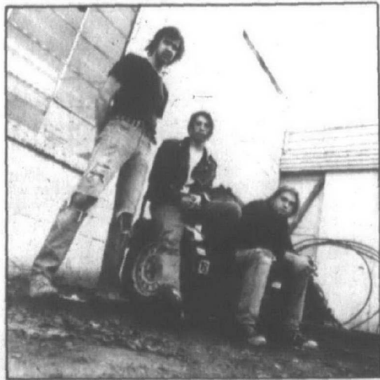
Nirvana will perform with guests, Urge Overkill, at St. Andrew's Hall in Detroit Friday, Oct. 11.