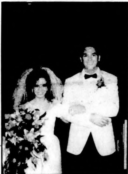
They are making their home in Farmington Hills.

The couple received guests at the Ritz-Carlton Hotel in Dearborn before leaving on a trip to Lake Michigan.