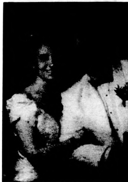
trip to Jamaica. They are making their home on Pickeral Lake, Scotts, Mich.

The couple received guests at Fox Hills Country Club before leaving on a