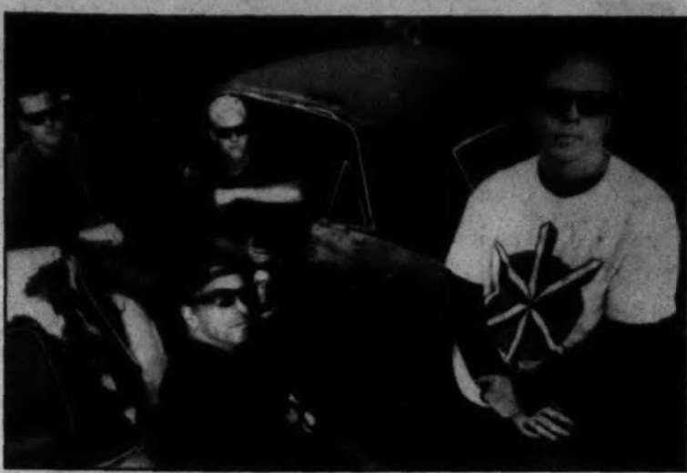
Come out and play: The Offspring - from left, bassist Greg K., guitarist/vocalist Kevin "Noodles" Wasserman (in baseball hat), drummer Ron Welty (in car), and singer/guitarist Dexter Holland - come out to Detroit to play the State Theatre on Sunday, May 18.

"So protect your family. This album contains explicit depictions of things which are real. These real things are commonly known as life. So if it sounds sarcastic don't take it seriously. If it sounds dangerous do not try this